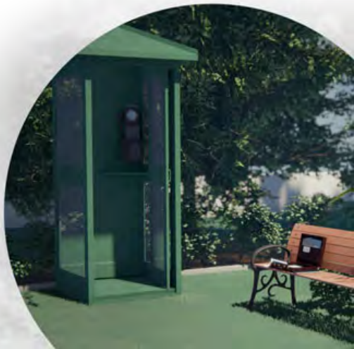
CACI’s “First Office”