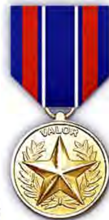
Office of the Secretary of Defense Medal of Valor

continued to earn praise throughout 2018. Over the years, we had earned recognition such as the Virginia Governor's Award for Veterans Hiring (#1 ranking) and the Employer Support of the Guard and Reserve Patriot Award. We had been named a Military Friendly Employer by G.I. Jobs , Best for Vets by Military Times , and Best of the Best Top Veteran Friendly Company by U.S. Veterans Magazine .