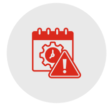
CURRENT PLATFORM SUNSETS IN 2027