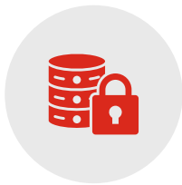
SYSTEM AND DATA PROTECTION